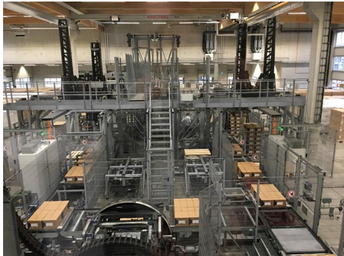
Mediscan facility to sterilize medical products with electron accelerator www.mediscan.at

"Accelerators can replace radioisotopic sources in many applications."