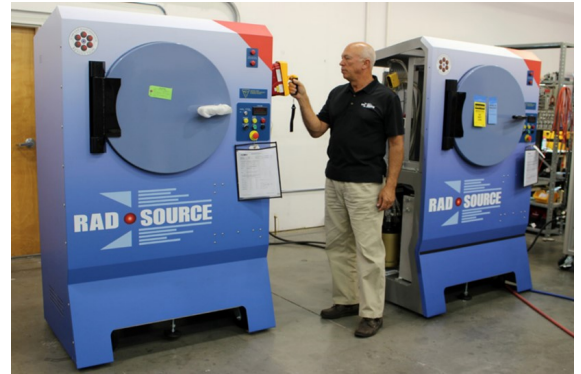
Rad Source blood irradiator www.radsources.com

Accelerators can potentially replace radioisotopic sources in many applications. For example, numerous cesium-137 sources used for blood irradiation have already been successfully replaced with low-energy x-ray units. These machines are compact and self-shielded so they can easily be installed in a regular room in a hospital. Many research institutes, universities, and government laboratories also consider and even already have begun the conversion from cesium and cobalt sources for R&D purposes to x-ray devices or electron accelerators. Replacement of cobalt-60 teletherapy units for cancer treatment is also